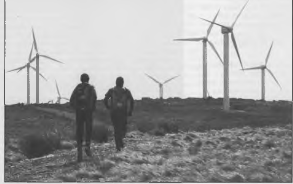
Windmills at the 1994 Howarth Hobble

In the last few years I've been approached by a number of companies keen to investigate the siting of windfarms on my ground. Glen Dye is appealing to these companies because we have hills and therefore wind and, crucially, because we have a good sized road running through the Estate. Good access is a vital