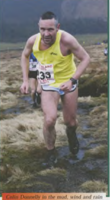
at Pendle

A typical entry is now less than 50 runners and even English Championship status in 1999 only boosted this to 184 finishers. In some