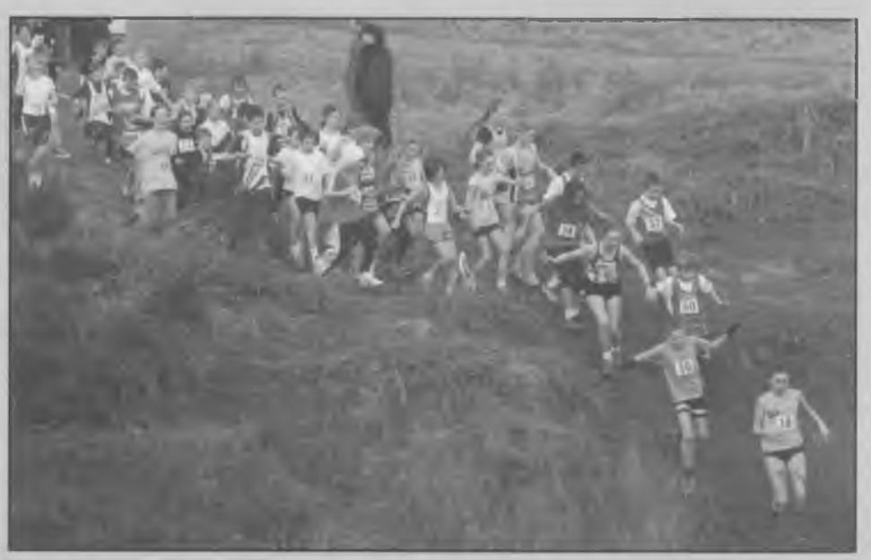
The juniors just after the start at Ilkley

Of course up at the front the odd mile or ten makes little difference and over the years the roll call of winners includes